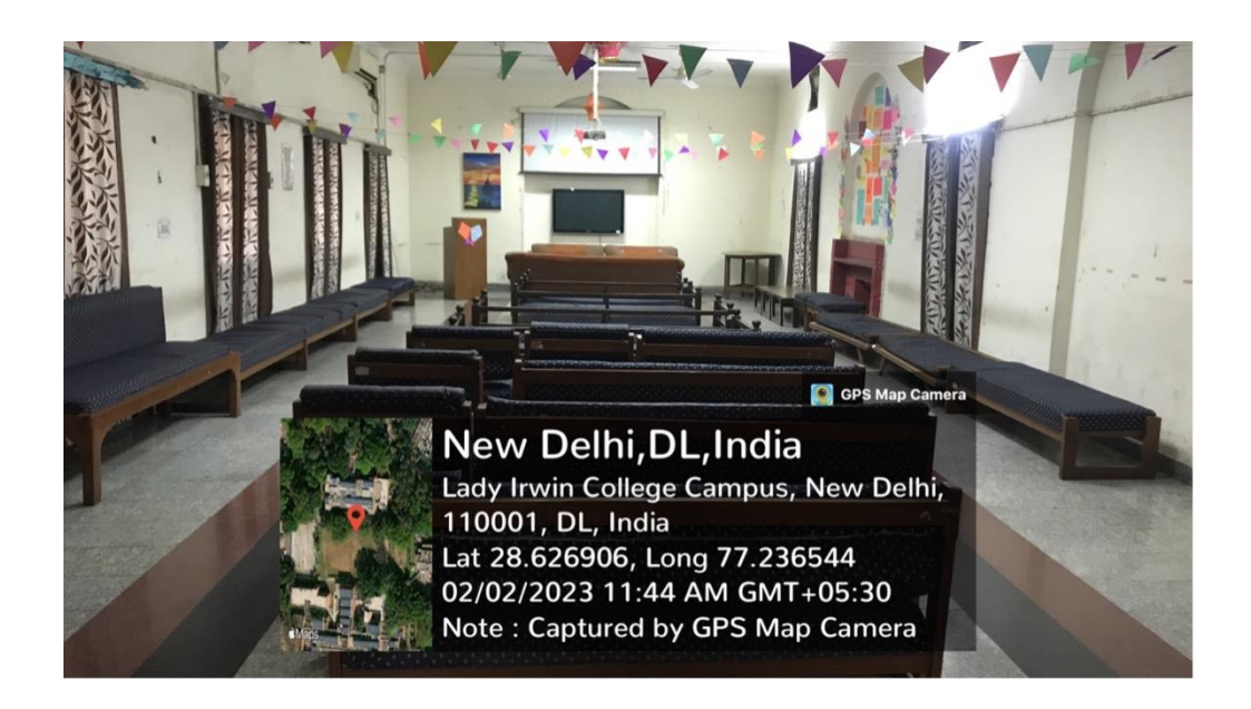
Hostel Common Room