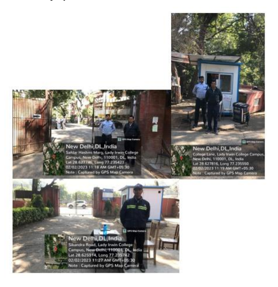
Guarded front and back gates of the College

The College is secured by manned main gates and entry point screening. To ensure the safety of all the students and employees, CCTV cameras have also been installed across the campus.