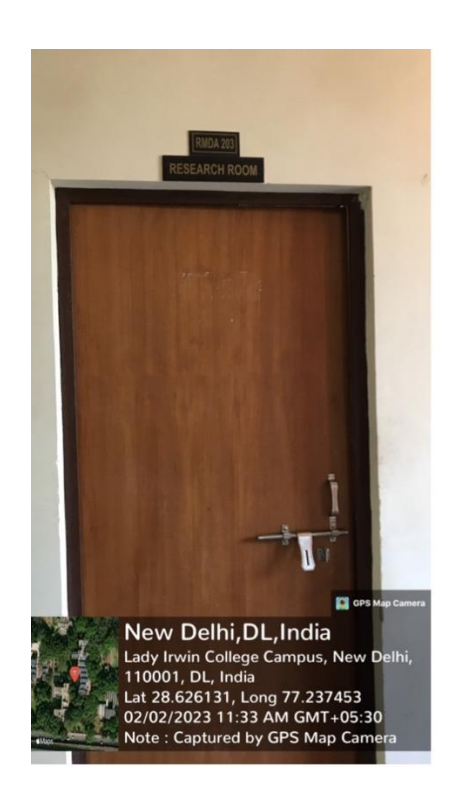
PhD Scholars' Room