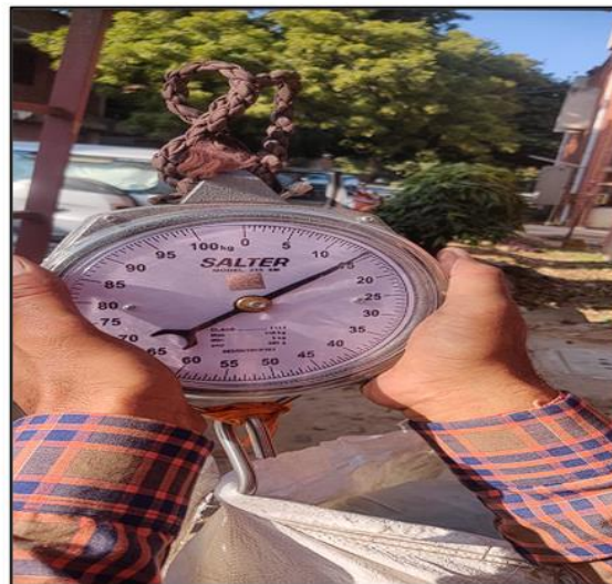
Weighing plastic waste

Kitchen and Garden waste: In April 2019, Lady Irwin College in collaboration with Indian Pollution Control Association (IPCA) took an initiative to install Aerobins in the campus. Aerobins have revolutionized the system of home and garden waste management. They use a patented lung or aeration core inside a sealed bin to promote aerobic break down of organic matter releasing nutrients into the soil. Presently, aerobins are installed near the hostel mess of the college. Other than this, the kitchen and garden waste is also managed by converting it into manure