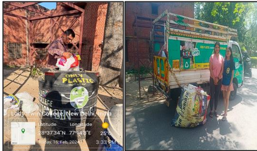
Plastic waste collection drive

celebrations where students creatively reused plastic waste to design planters. Both the Leaf Plate Making and plastic recycling programs highlight the college's commitment to promoting eco-friendly practices and building a more sustainable community.