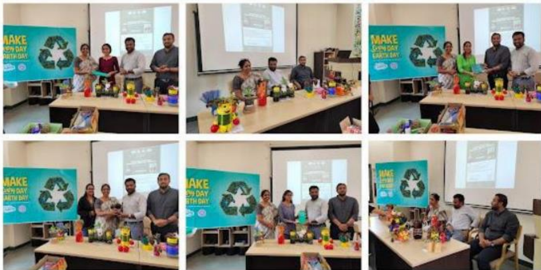
Celebrating the entries and the winners of the competition on Earth Day