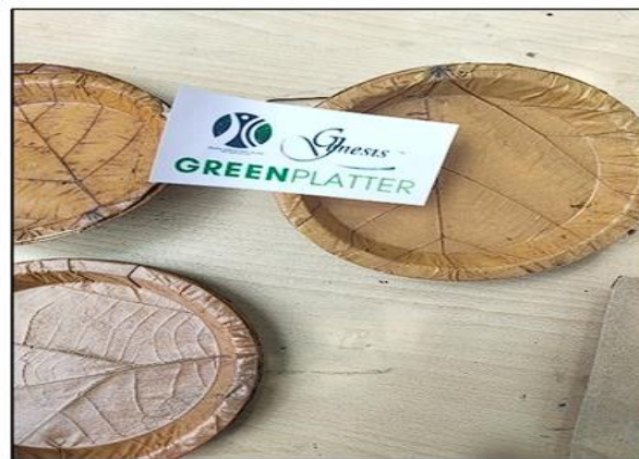
Leaf plates made from dried and fallen machkan leaves

The user is involved in various initiatives at Lady Irwin College aimed at promoting sustainability and environmental consciousness. One notable project is the Leaf Plate Making initiative under the DIC SPOKE program, which uses fallen dried Machkan leaves from the college premises to produce eco-friendly, biodegradable plates. This project, which began in January 2022, promotes green alternatives to single-use plastic. It also involves a comprehensive Leaf Plate Creating Course that teaches participants how to craft these plates, with an emphasis on sustainability, creativity, and hands-on learning. The initiative not only showcases innovation but also encourages future environmental projects and entrepreneurial ventures.