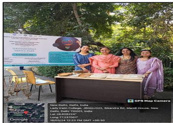
Crafting sustainable solutions: Leaf plate making under DIC SPOKE Project